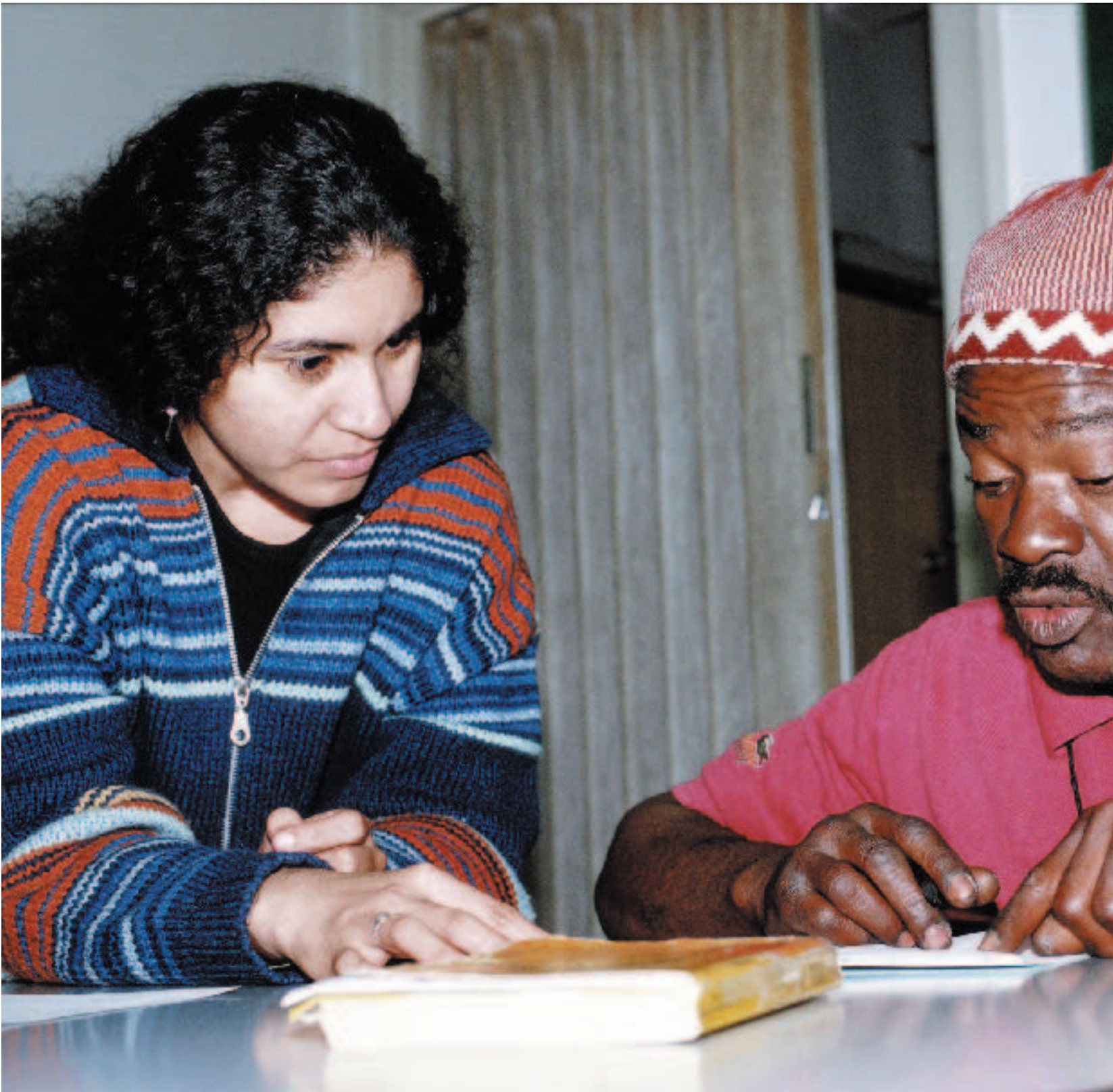
Brazil: Refugees who are afforded resettlement opportunities in Brazil are helped to become self-reliant. Here, a resettled refugee is taking extra lessons.

immigration policies for MERCOSUR. In this respect, UNHCR coordinated activities with IOM and participated in a meeting on the Bern Initiative on migration issues in Bolivia.