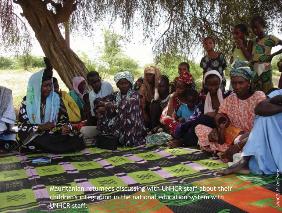
Mauritanian returnees discussing with UNHCR staff about their children's integration in the national education system with UNHCR staff.