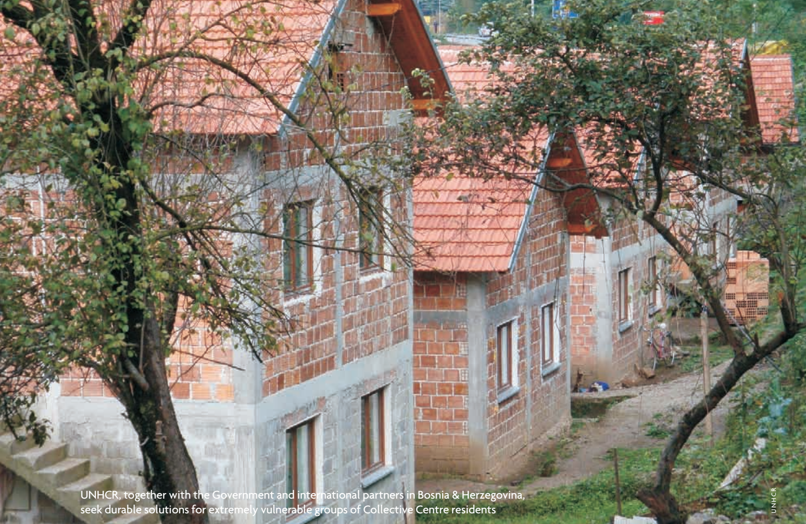
UNHCR, together with the Government and international partners in Bosnia & Herzegovina, seek durable solutions for extremely vulnerable groups of Collective Centre residents