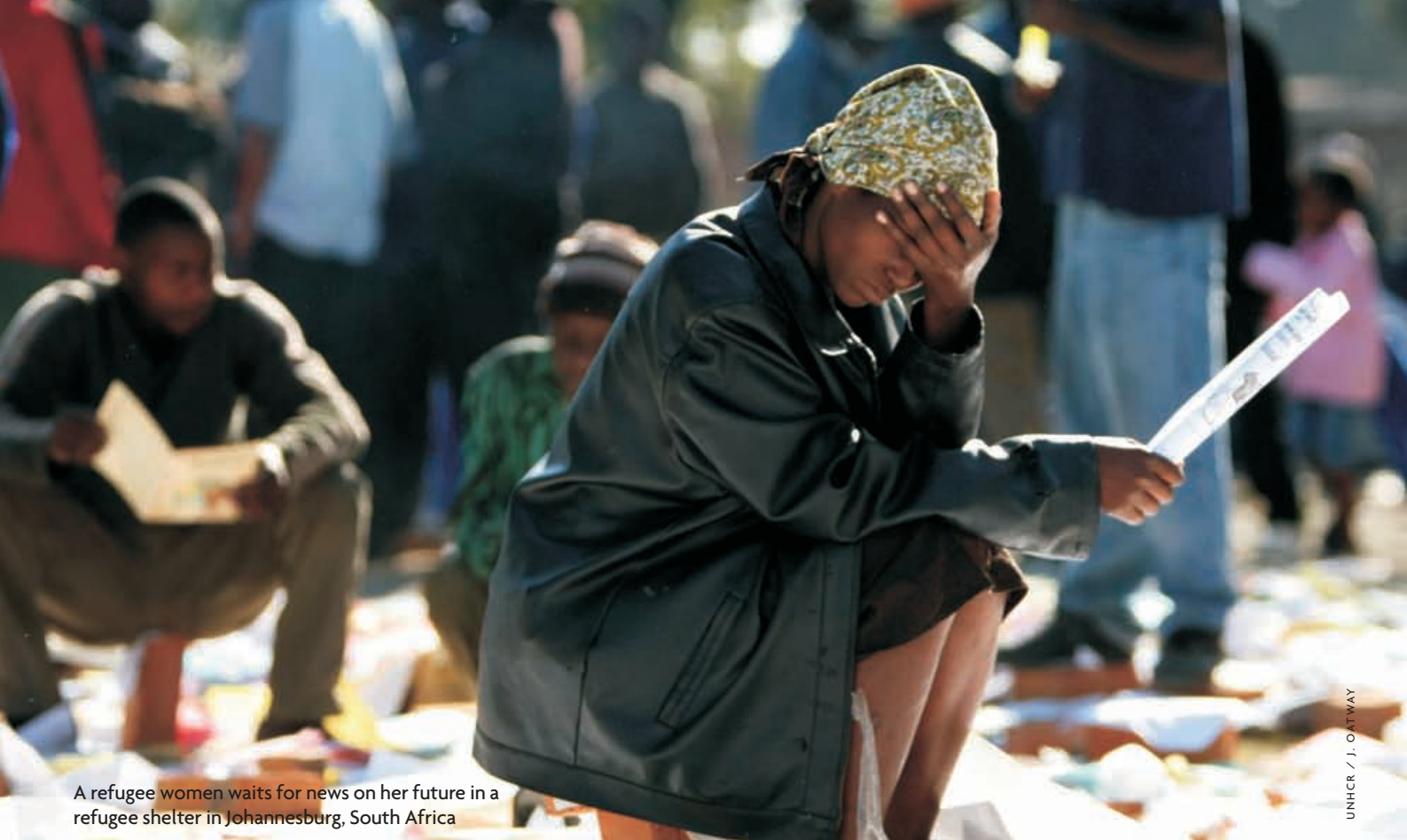
A refugee women waits for news on her future in a refugee shelter in Johannesburg, South Africa