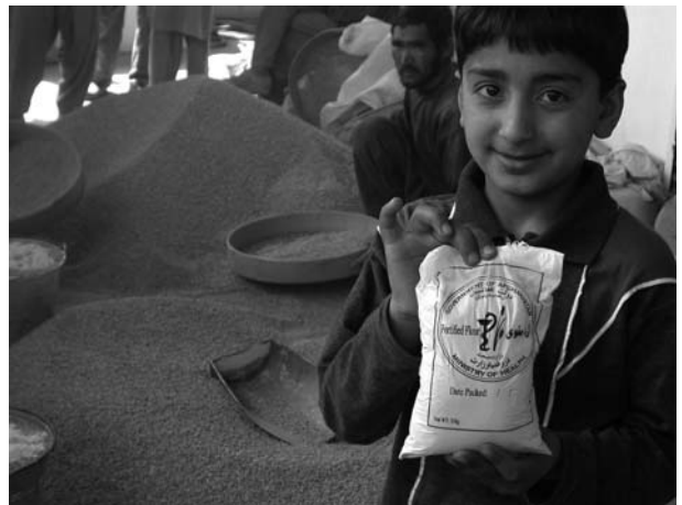
Different stages in the production process in a chakki mill in Afghanistan: from adding a vitamin and mineral premix to whole wheat grains to the end product, a packet of fortified flour.

significant impact that fortification has on reducing micronutrient deficiencies.