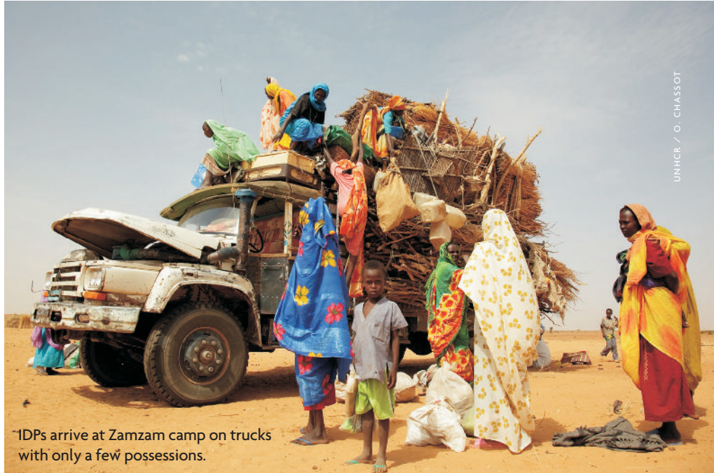
IDPs arrive at Zamzam camp on trucks with only a few possessions.

At the national level, UNHCR worked with the Ministry of Justice in providing comments to the draft asylum bill and also