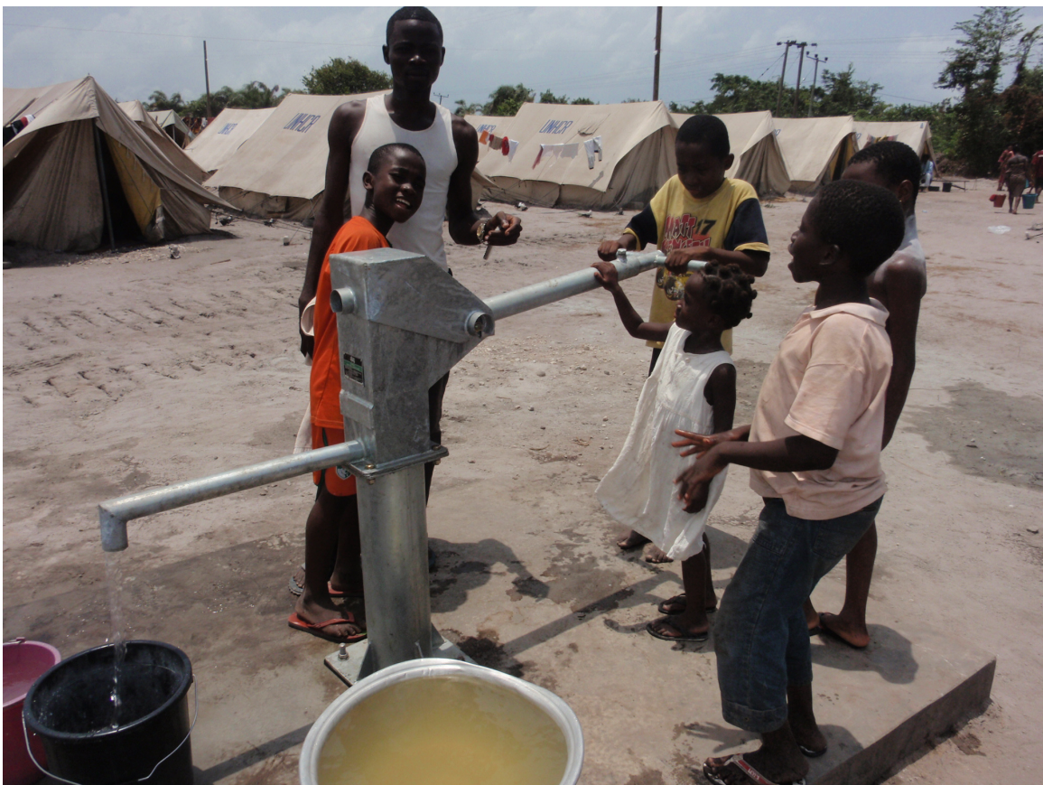
Borehole, Ampain Camp, Ghana