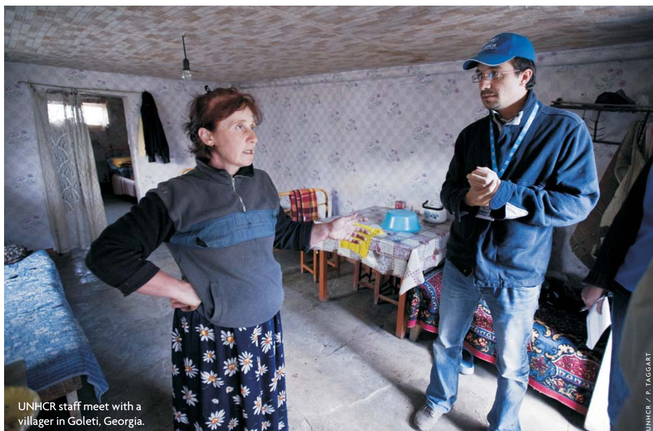
UNHCR staff meet with a villager in Goleti, Georgia.