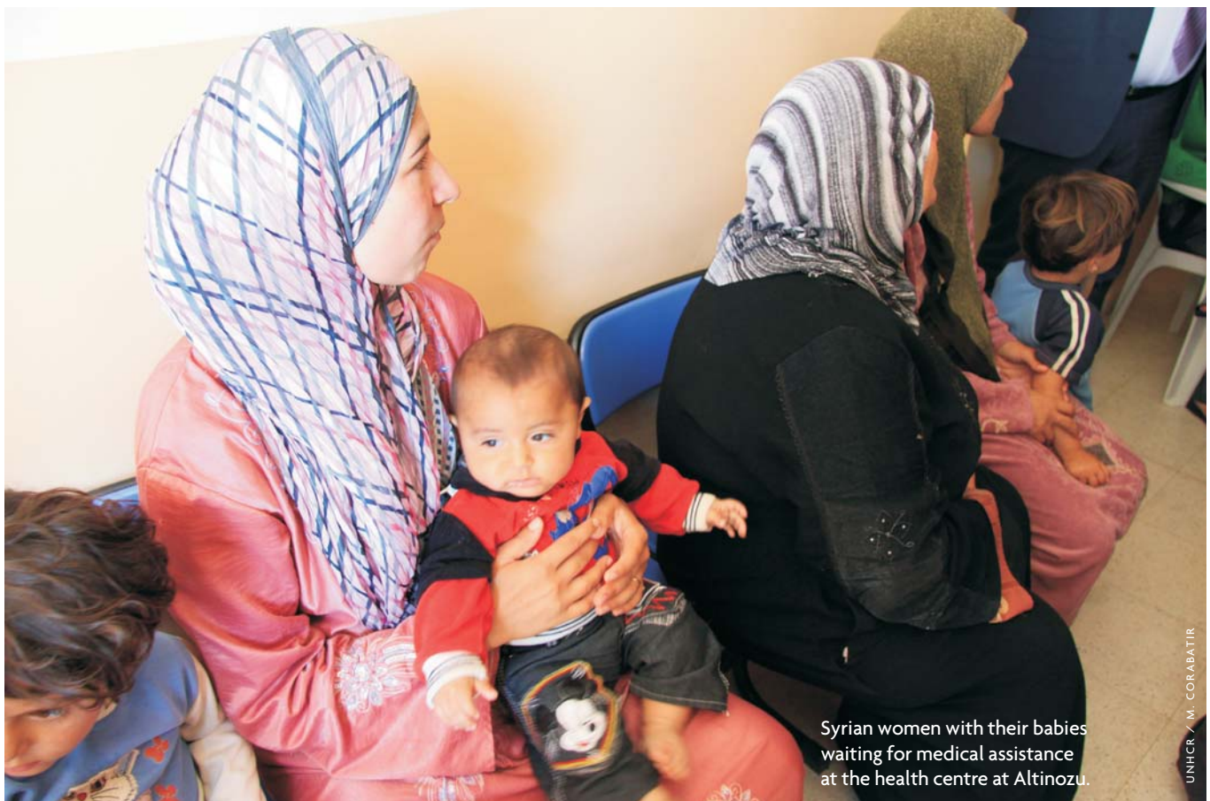
Syrian women with their babies waiting for medical assistance at the health centre at Altinozu.

national asylum system based on international standards, and providing protection for current asylum seekers. UNHCR was intensively engaged in the drafting of the law on asylum and in the asylum unit providing support and expertise.