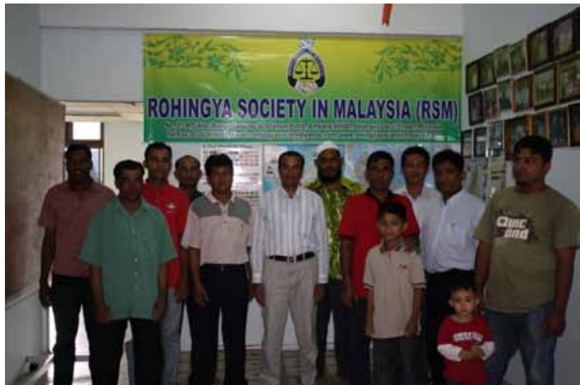
Men participate in a group discussion.