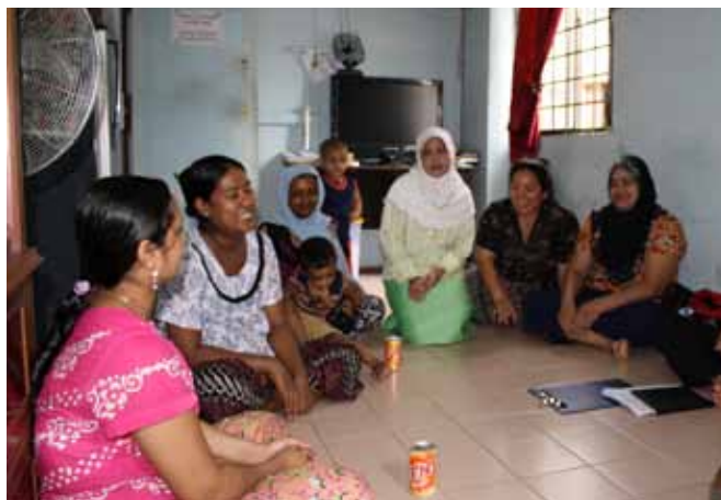
Women participate in a group discussion.

Centers for Disease Control and Prevention (CDC) is a U.S. government agency. The CDC has a Division of Reproductive Health that addresses the reproductive health of refugees and internally displaced persons in emergency and post-emergency settings.