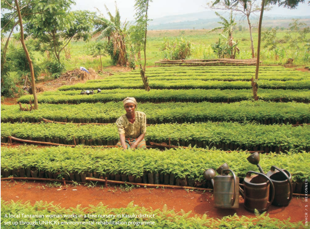
A local Tanzanian woman works in a tree nursery in Kasulu district set up through UNHCR's environmental rehabilitation programme.

provided by some 340 male and 90 female qualified primary teachers. A five-day workshop on teaching methods, with support from an implementing partner, was conducted for all post-primary teachers.