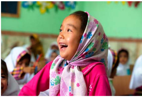
Afghan refugee girls studying in school in Varamin