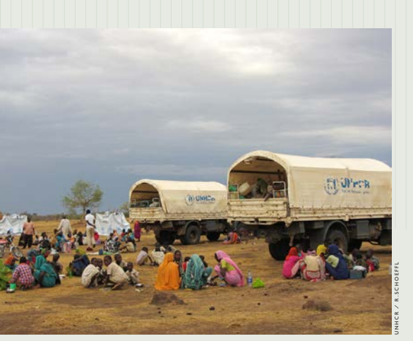
Refugees in Tissi wait to board trucks that will take them to the Ab Gadam camp.

Tissi, Chad | The UN refugee agency has relocated thousands of Darfuri refugees from the volatile border area of Tissi in south-eastern Chad to Ab Gadam, a new camp deeper inside the country.