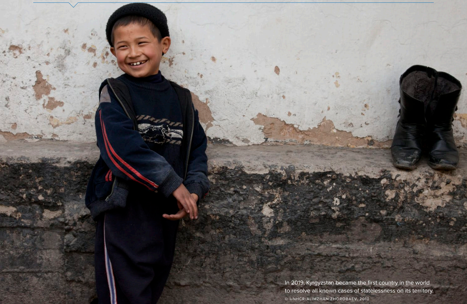
In 2019, Kyrgyzstan became the first country in the world to resolve all known cases of statelessness on its territory.