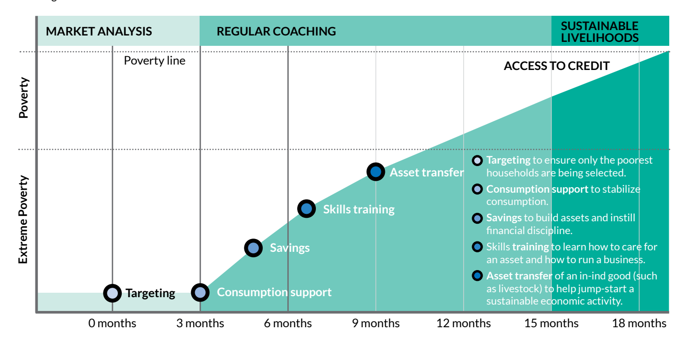
Diagram source: UNHCR Ecuador