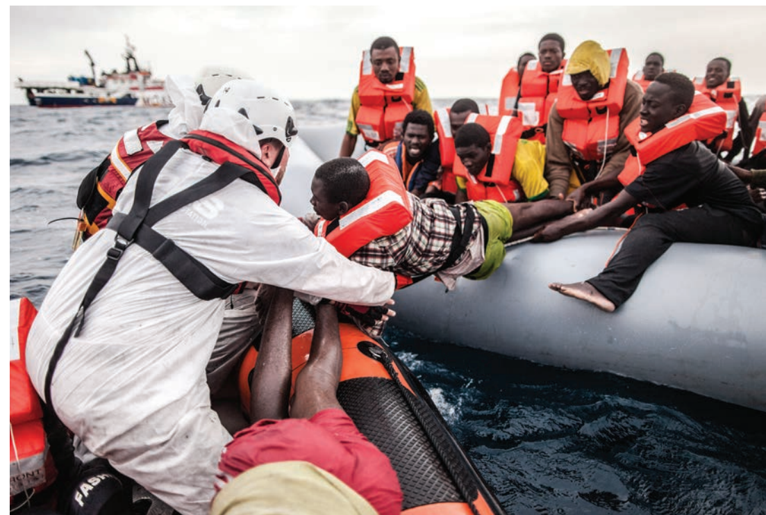
Rescue workers shuttle a group of tired, cold and hungry refugees to a rescue boat.

for persons of concern in line with international human rights law, humanitarian and refugee law and national laws and responsibilities.