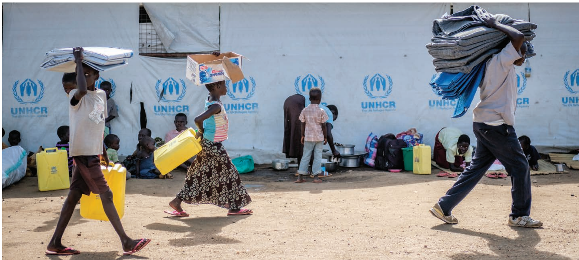
Recently arrived South Sudanese refugees received blankets and other relief items at Imvepi reception center in Arua district in Northern Uganda near South Sudan, 1 May, 2017.