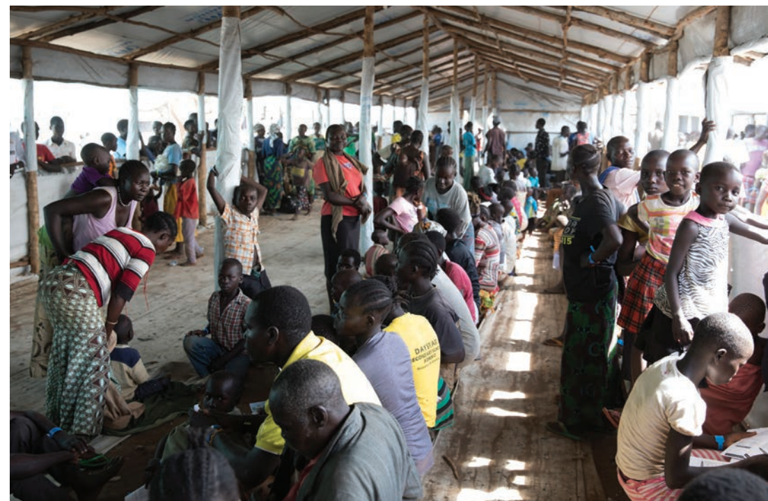
On arrival at Impevi, Uganda, refugees go through a medical screening where all children under 15 are vaccinated against measles and all children under 5 receive polio drops.