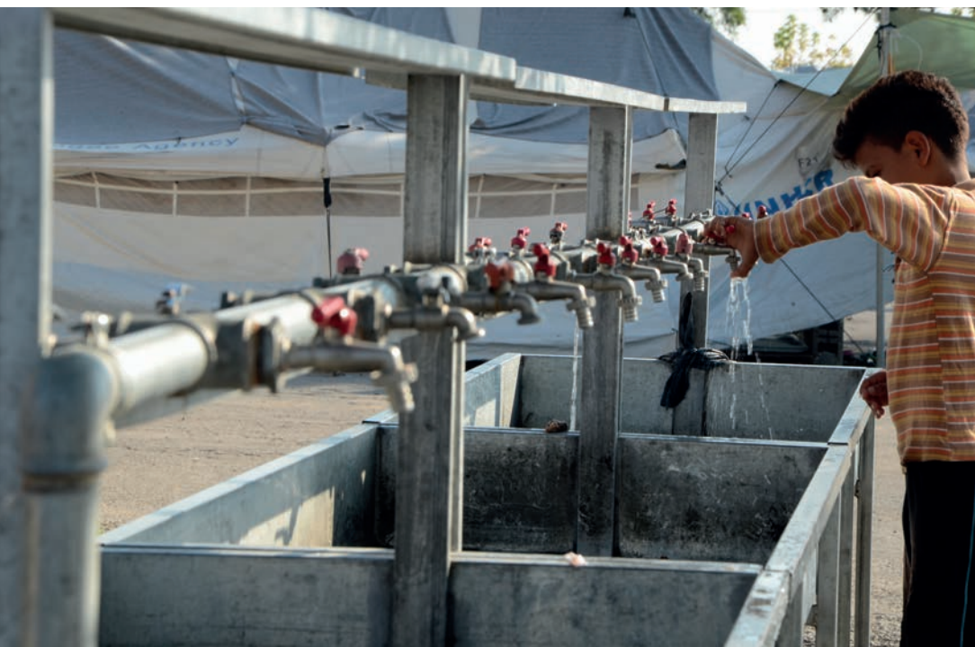
Sanitary and drinking water facilities in Alexandria in a Greek camp, which was established with the help of UNHCR and European Commission funds for Civil Protection and European Humanitarian Aid Operations (ECHO).

6.5. Where the risk relates to a non-refugee situation, UNHCR will participate in the RC/HC-led inter-agency processes and lead relevant cluster preparedness through the “Emergency Response Preparedness” (ERP) approach developed and endorsed by the Inter-Agency Standing Committee (IASC) which provides tools for UN Country Teams and Humanitarian Country Teams (HCT) to understand and prepare for risks and establish a system to monitor them.