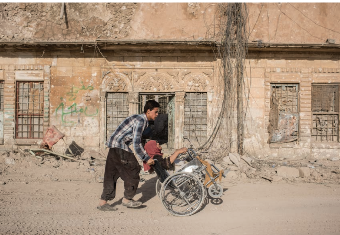
A man pushed a woman passed an old building while fleeing fighting in Mosul, Iraq on June 24, 2017.

experience and authority across the entire spectrum of the response (planning, operational, monitoring, reporting and information management), including by seeking support from Headquarters and other sources as needed; and