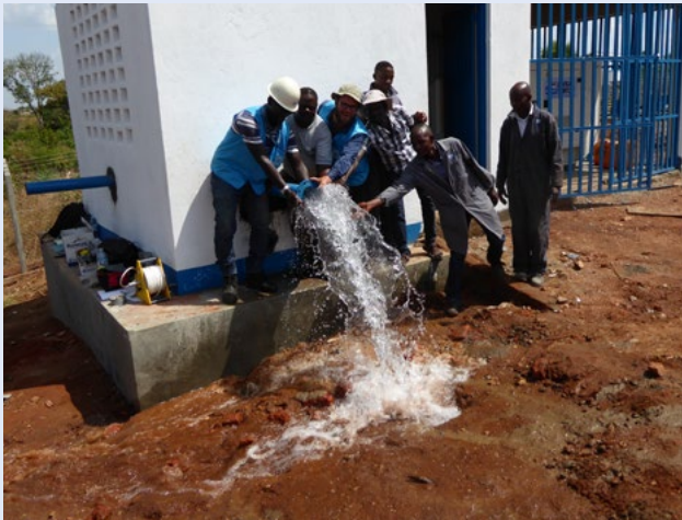
High-yielding borehole sited with RGWPM in Bidibidi.

The use of RGWPM in the case study of Northern Uganda increased the average yield for boreholes by an order of magnitude, from an average of 3 m 3 /hour for the boreholes sited 'without' RGWPM to 35 m 3 /hour for the boreholes sited with RGWPM. These wells met UNHCR minimum standards and triggered the transition from emergency water supply (water trucking and hand pumps) towards sustainable solar systems. These results have shown that well-siting for motorised/solarised systems is significantly improved with the use of RGWPM.