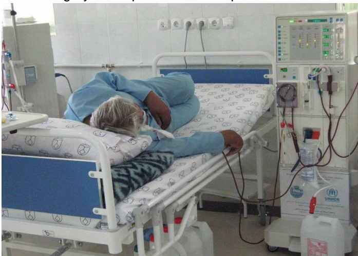
An Afghan refugee receives essential dialysis treatment thanks to the Government of Iran-led insurance (UPHI) scheme.