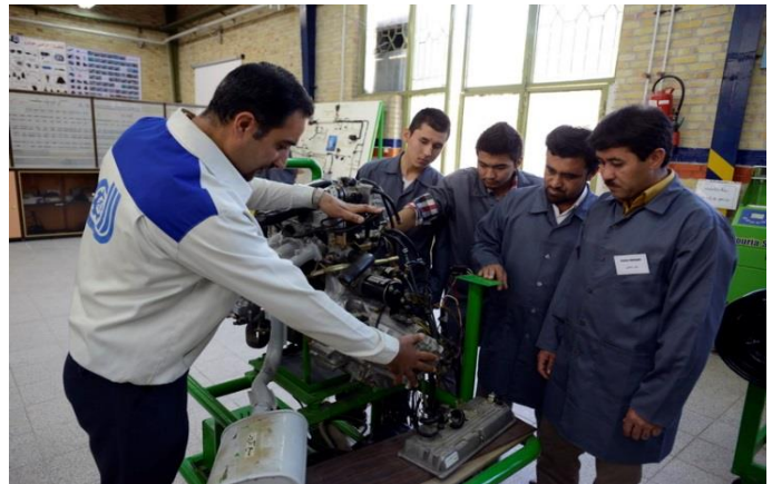
Through technical and vocational training courses young Afghan refugees in Iran develop marketable skills, including in mechanics. Feb 2016

The SSAR is a quadripartite multi-year regional strategy between UNHCR and the governments of Afghanistan, Pakistan, Iran that was launched in 2012 and aims at ensuring the protection of Afghan refugees, and finding solutions for them. Following a quadripartite meeting between the three governments and UNHCR in December 2017, the SSAR was extended for 2018-2019. The extension is based on the original SSAR Framework from 2012, and the key objectives of the SSAR in Iran remain focused around the three pillars of health, education, and livelihoods. UNHCR has developed a regional document to further clarify our strategic direction following the two-year extension of the Framework, in line with government priorities. The document is called 'Enhancing Resilience and Co-Existence through Greater Responsibility Sharing' and places emphasis on the need to invest in the self-reliance of refugees to enable conducive stays in host countries as well as sustainable reintegration once conditions in Afghanistan become suitable for return. The document also emphasizes the need for enhanced responsibility and burden-sharing by the international community, in line with what is outlined in the Global Compact on Refugees, which was affirmed at the UN General Assembly in December 2018.