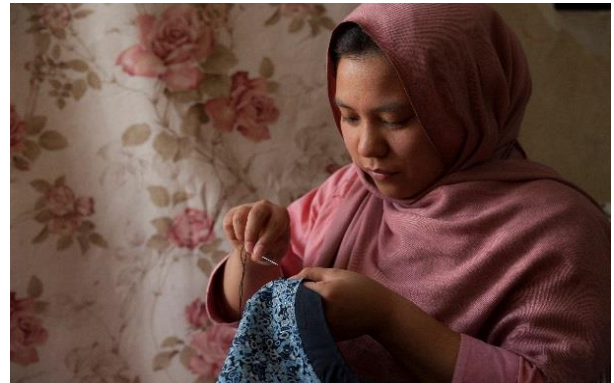
Some successful refugee entrepreneurs assisted by the Government of Iran and UNHCR are now employing Afghans and Iranians in their businesses.