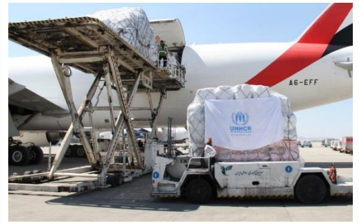
UNHCR's air freight of emergency relief items lands in Tehran to support national actors responding to flood affected areas in Iran. Hossein Eidizadeh/April 2019

Towards end March and into April 2019, floods swept 24 of Iran's 31 provinces, killing 78 and affecting some 10 million people, including a million refugees and foreign nationals. Prompted by the seriousness of the situation, UNHCR took an early decision, in coordination with the Bureau for Aliens and Foreign Immigrants Affairs of the Ministry of Interior (BAFIA), to use existing in-country resources including blankets, sleeping mats, jerry cans and kitchen sets to assist government-led relief efforts. Drawing on additional HQ reserves, UNHCR also dispatched 1,000 tents and other relief items from its global stockpile in Dubai. These were distributed to the most affected communities, including refugees, in five provinces in coordination with BAFIA.