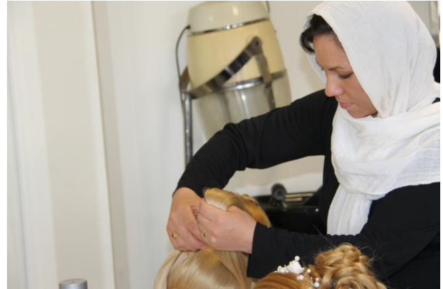
Through technical and vocational training courses young Afghan refugees in Iran develop in-demand, marketable skills.