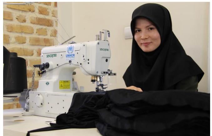
The Government of Iran, UNHCR and its non-governmental partners assist Afghan refugee entrepreneurs with business start-ups.