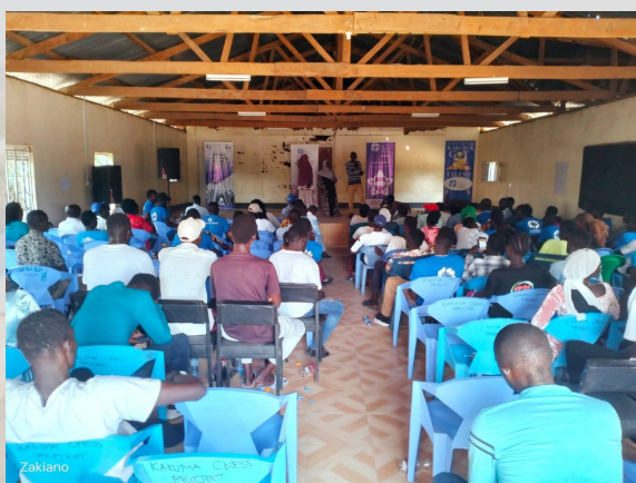
Participants at the 2023 Youth Congress deliberate on issues

The 2023 Youth Refugee Congress took place this month with more than 200 young refugees attending, giving them an opportunity to raise challenges in the camp, and suggestions for improvements.