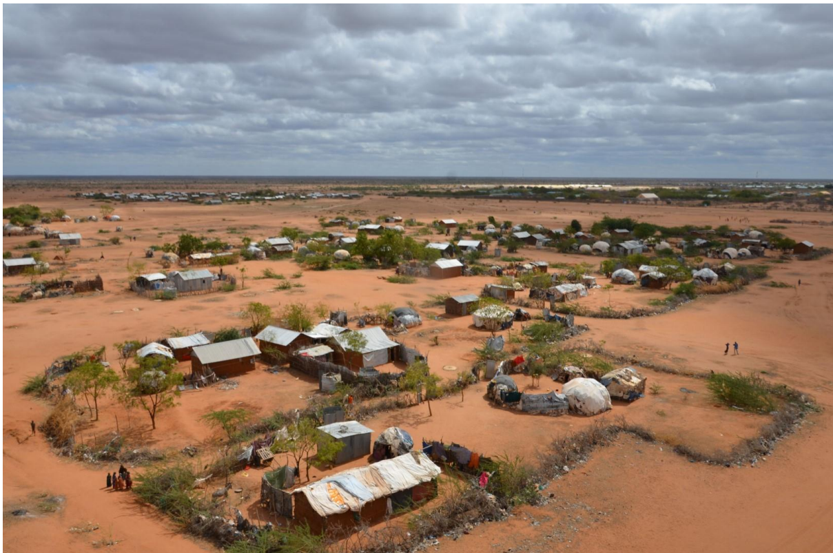
Ifo 2 camp of Dadaab with current population of 22,497 individuals of whom 7,893 individuals have registered for Voluntary repatriation.