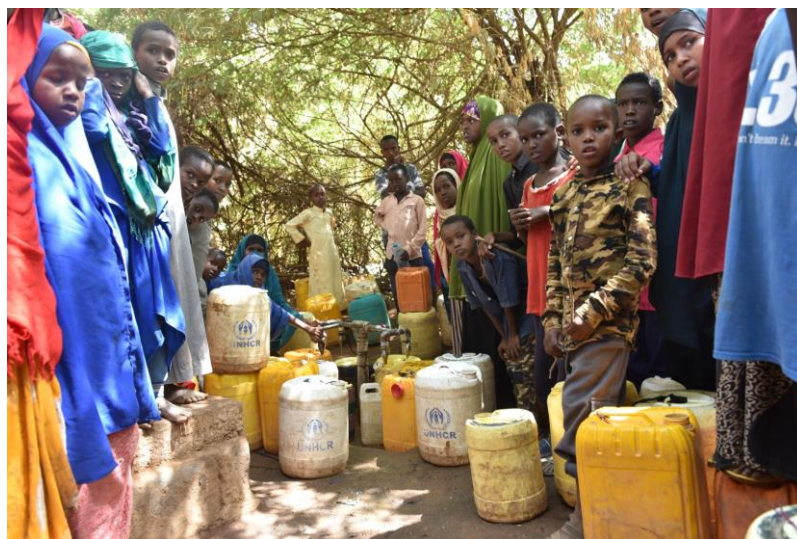
Refugees collect water from one the water distribution points in Ifo camp of Dadaab.