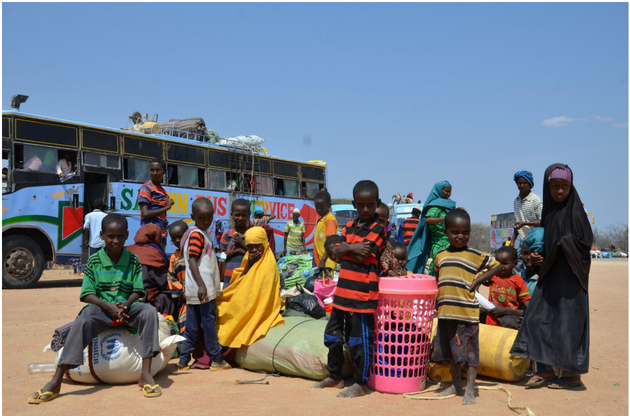
Refugees returning to Somalia under UNHCR voluntary repatriation Program.

As at 28 th February 2019, a total 79,113 refugees were facilitated to voluntarily go back to Somalia, from Dadaab refugee operations since the beginning of the process in 2014.