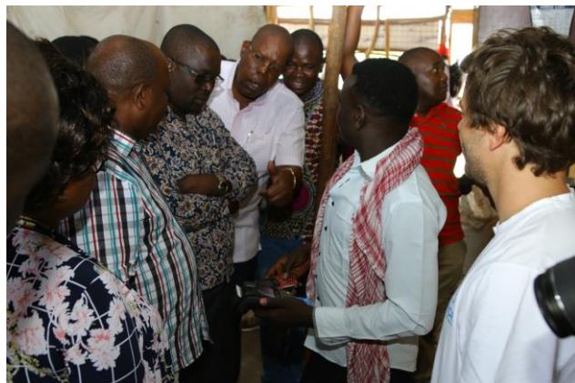
A refugee trader in Kalobeyei demonstrates the use of UNHCR branded debit card and a POS machine to Kenyan Members of Parliament Taskforce working on the review of the Refugee Bill.