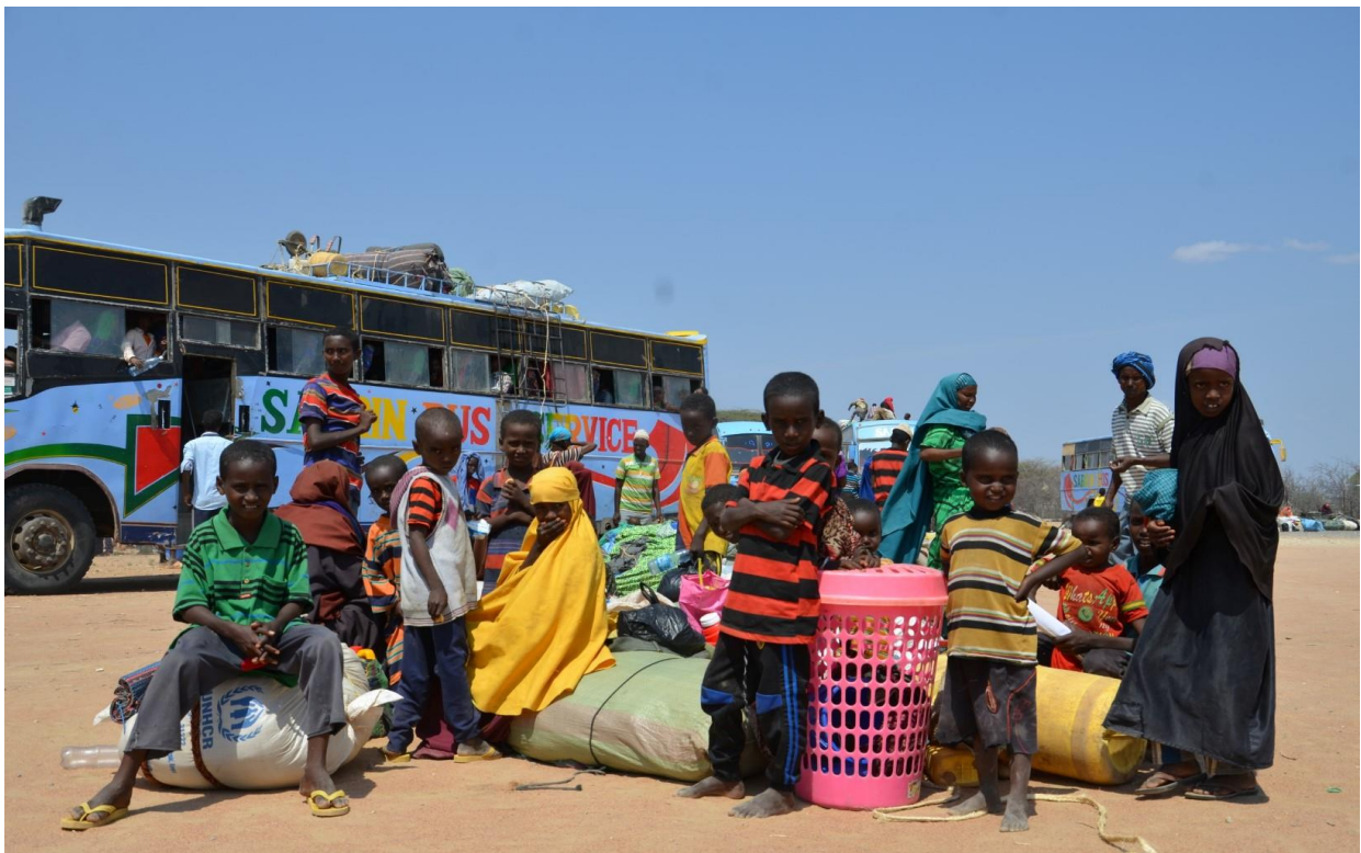
Refugees returning to Somalia under UNHCR's voluntary repatriation Program.