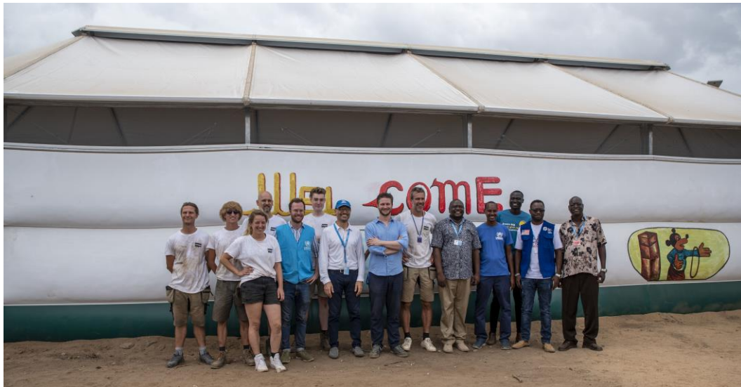
Maggie Shelter team, UNHCR and LWF colleagues pose for a photo outside one of the two Innovation Schools put up at Fashoda Primary School in Kakuma camp.