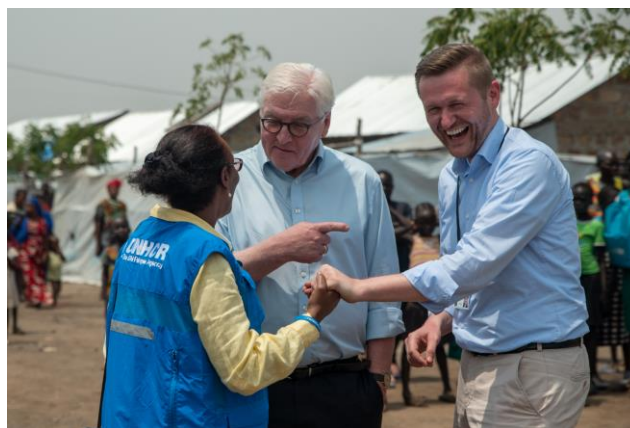
Photo of HE. Frank-Walter Steinmeier, president of the Federal Republic of Germany, when he visited Kalobeyei settlement.

Amount in Kenya Shillings distributed through UNHCR's Cash Based Intervention since June 2018.