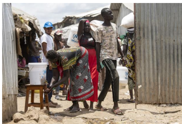
A woman washes her hands with soap and water at the entrance of Kakuma 1 market. Refugee businesses are following the Government's directive of establishing hand-wash points as a measure to curb the spread of covid-19.

Amount in Kenya Shillings distributed through UNHCR's Cash Based Intervention since June 2018.