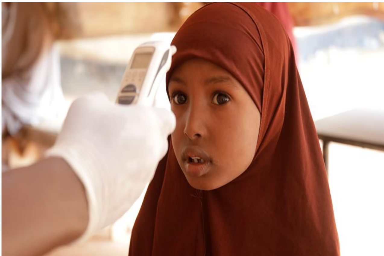
Temperature detection thermometer to prevent and contain the spread of COVID-19 in Dadaab refugee camps. © UNHCR/Dennis Munene, 9 April 2020.