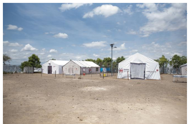
UNHCR supported 36 bed capacity COVID-19 Isolation and Treatment centre at the Nalemsokon Health Clinic in Kalobeyei Settlement.

Cumulative confirmed COVID-19 cases among persons of concern and humanitarian workers.