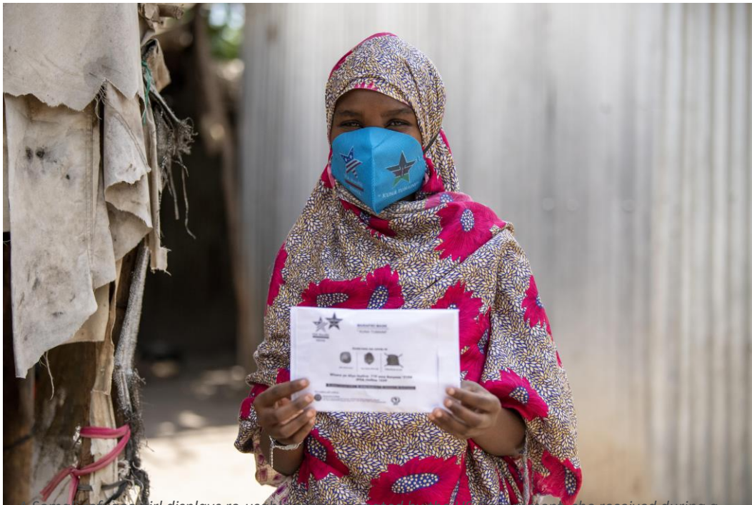
A Somali refugee girl displays re-usable masks, donated by the US Government, she received during a distribution exercise in Kakuma 3.