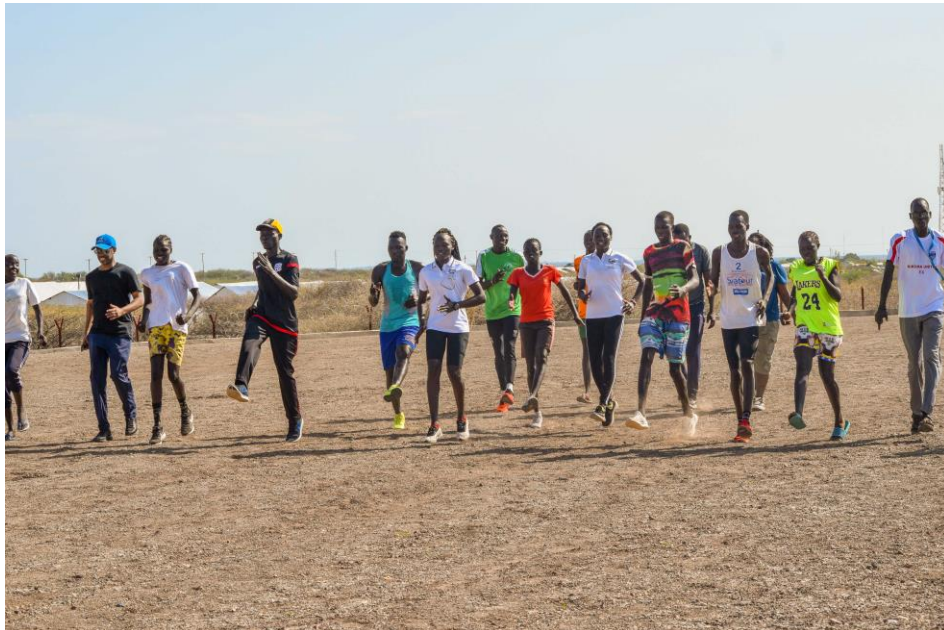
The Head of Sub Office joins the Refugee Olympic Team athletes and other young athletes during a training session at the Olympic Stadium in Kalobeyei settlement.