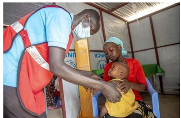
In Kakuma, UNHCR works with partners to support continued screening and refers children at malnutrition risk to nutrition clinics.

Refugees departed to various resettlement countries between 1 January to 31 August 2022