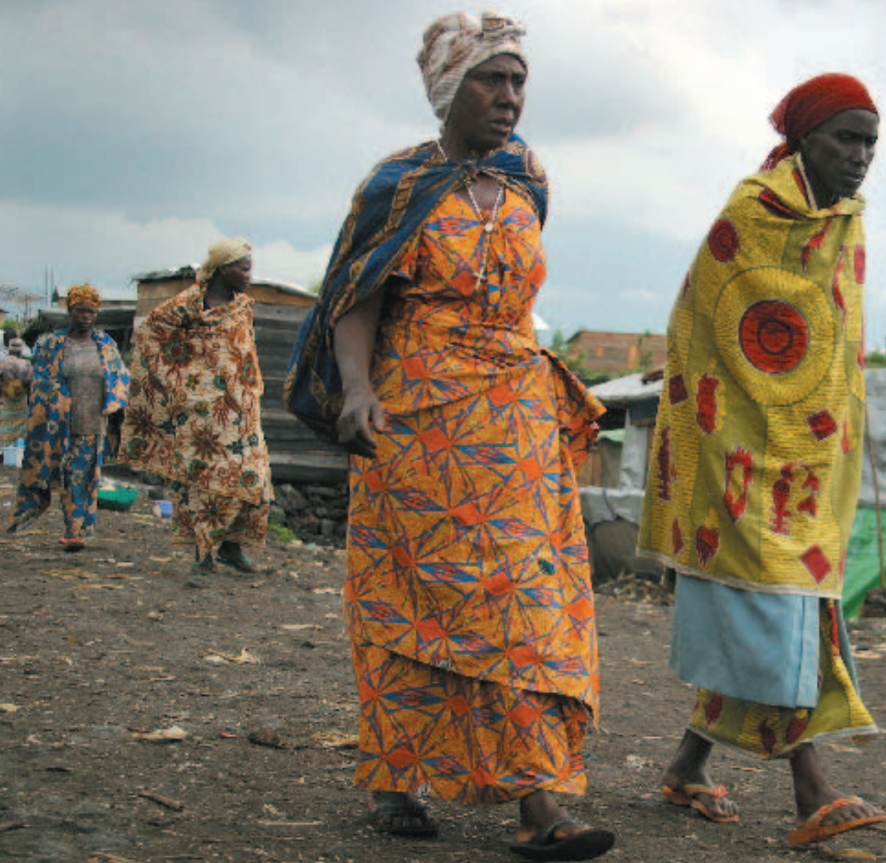
Democratic Republic of the Congo: The location is the Mugunga refugee camp near Goma. This area is now inhabited by people who have been relocated there by the Government after their village was destroyed by the eruption of the Nyiragongo Volcano in 1996.

The ultimate success of the transitional Government was thrown into doubt by an extremely slow programme of disarmament, demobilization and reintegration, as well as almost uninterrupted violence in the east. Two failed attempted coups d'état, in March and June 2004, served only to further underline the risk of widespread and intractable insecurity.