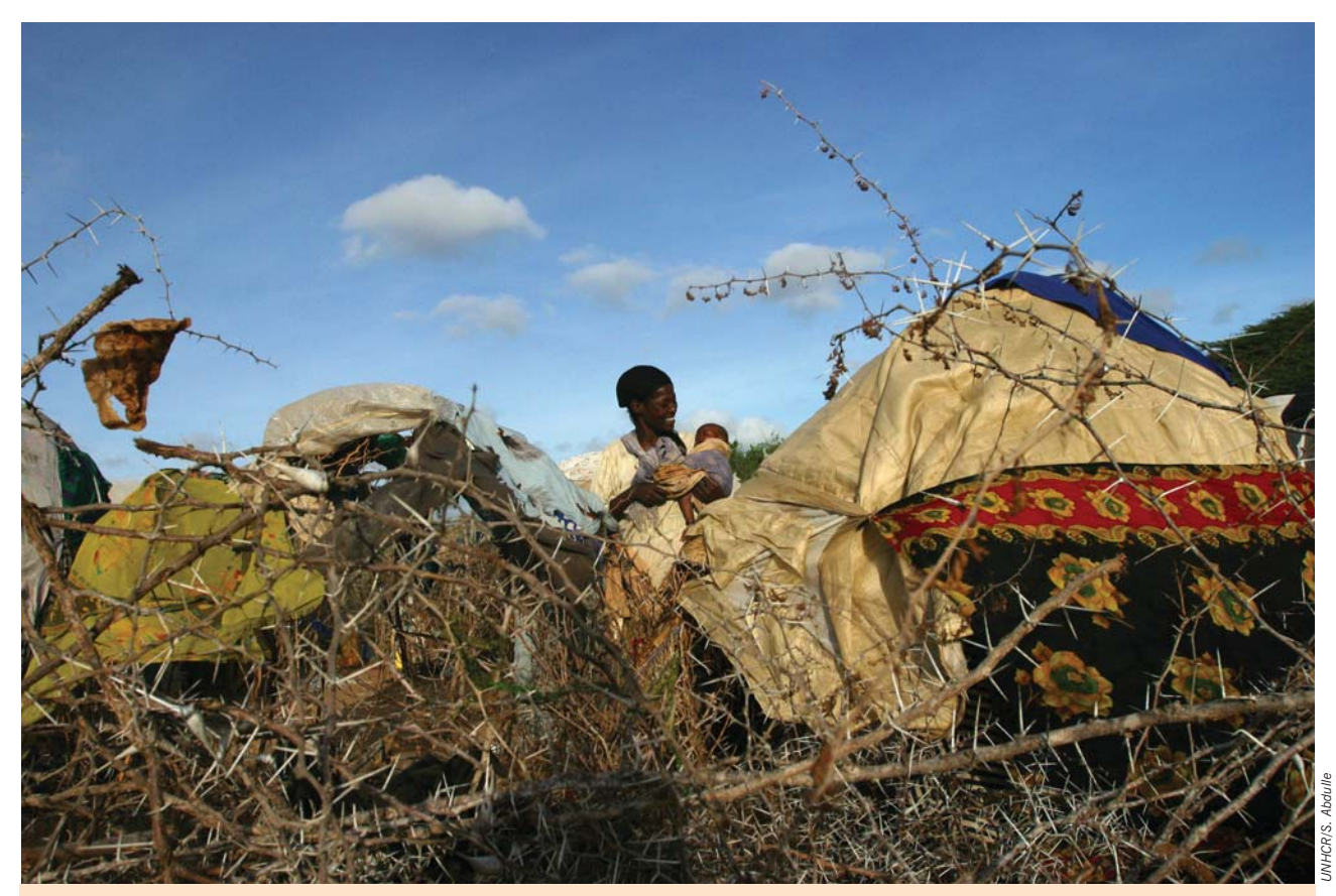
Following renewed fighting, IDPs living in Mogadishu were displaced a second time to Lafole. UNHCR and partners distributed relief and shelter supplies to some 35,000 persons.

Sanitation: UNHCR improved sanitation in Awdhegle, Qoryooley, Bulo and Mereer in Lower Shabelle, benefiting more than 9,000 people.