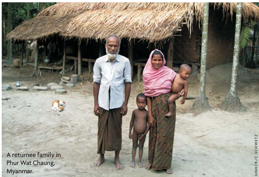
A returnee family in Phur Wat Chaung, Myanmar.