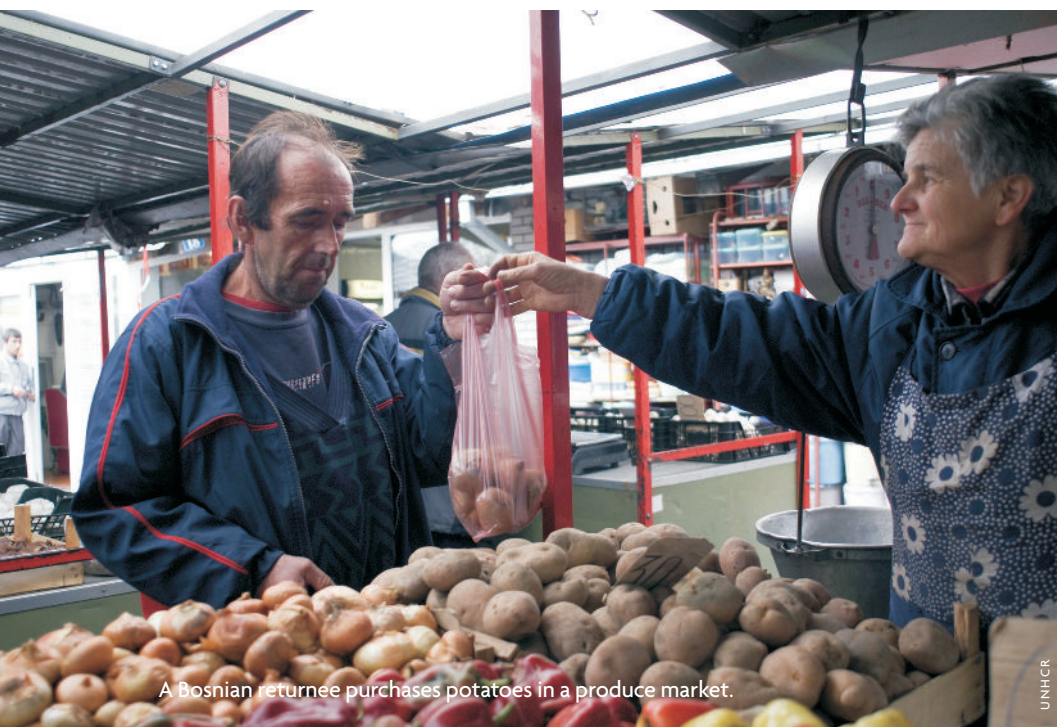
A Bosnian returnee purchases potatoes in a produce market.

UNHCR has developed a dynamic partnership with the Swiss Agency for Development and Cooperation in the framework of a project to support vulnerable members of the Roma community. UNHCR solidified its partnership with State ministries dealing with refugee and IDP issues. UNHCR also continued to act as an observer in the State Commission for Refugees and Displaced Persons. The Office strengthened its collaboration with the OSCE, the EU Delegation, EUPM, EUFOR, the UN Resident Coordinator, NATO, IMF and the World Bank. UNHCR is an active member of the UN Country Team and