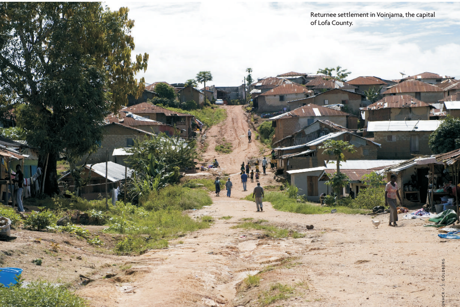
Returnee settlement in Voinjama, the capital of Lofa County.

A joint Government/UNHCR committee worked on the draft amendment to the 1993 Refugee Act governing refugee protection in Liberia. The Government took on additional