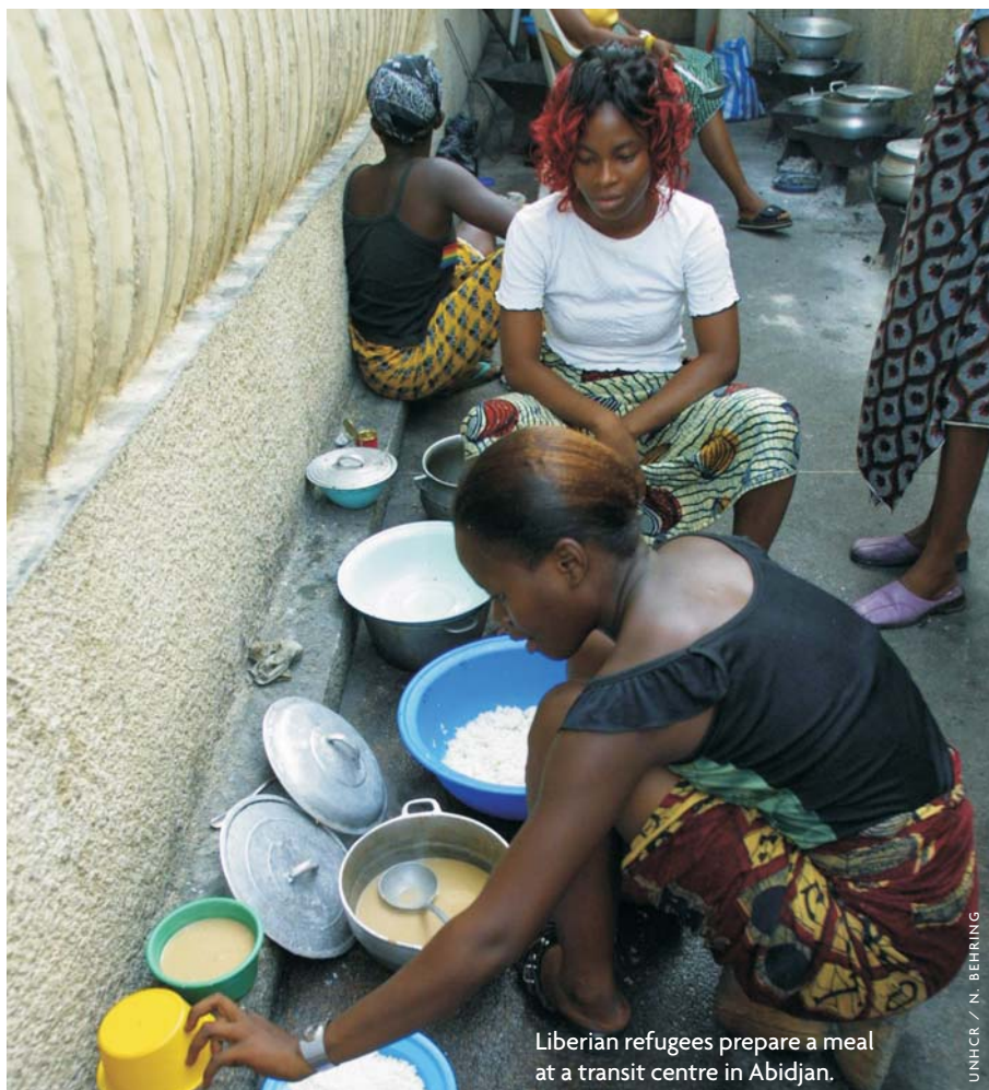
Liberian refugees prepare a meal at a transit centre in Abidjan.