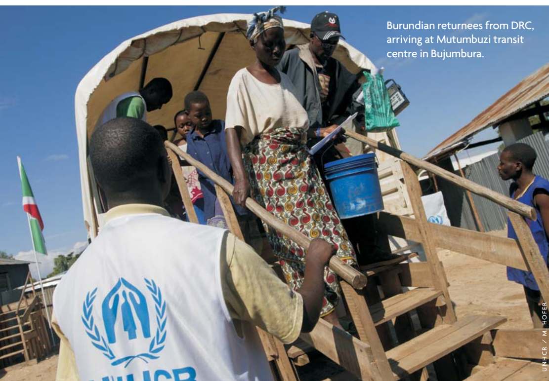
Burundian returnees from DRC, arriving at Mutumbuzi transit centre in Bujumbura.