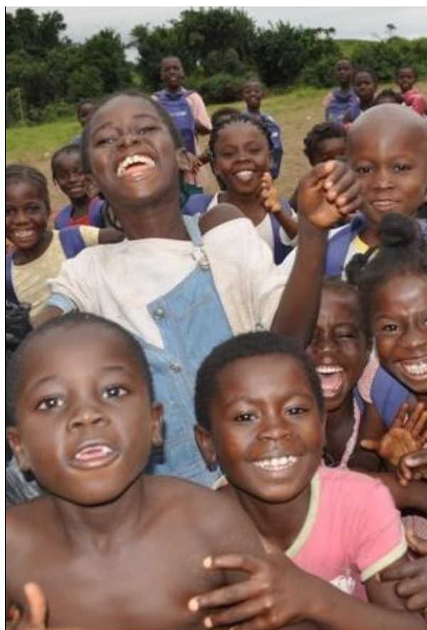
Children in Little Wlebo camp, Liberia

(*) In addition, Luxembourg donated USD 87,015 towards UNHCR's initial response in Côte d'Ivoire in December 2010.