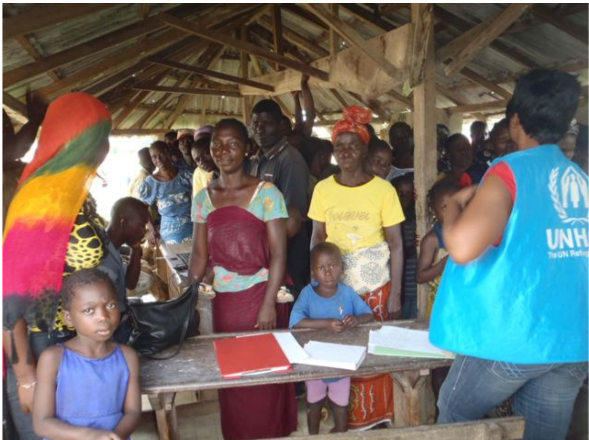
UNHCR monitors the registration of Ivorian returnees in Toulepleu, Cote d'Ivoire