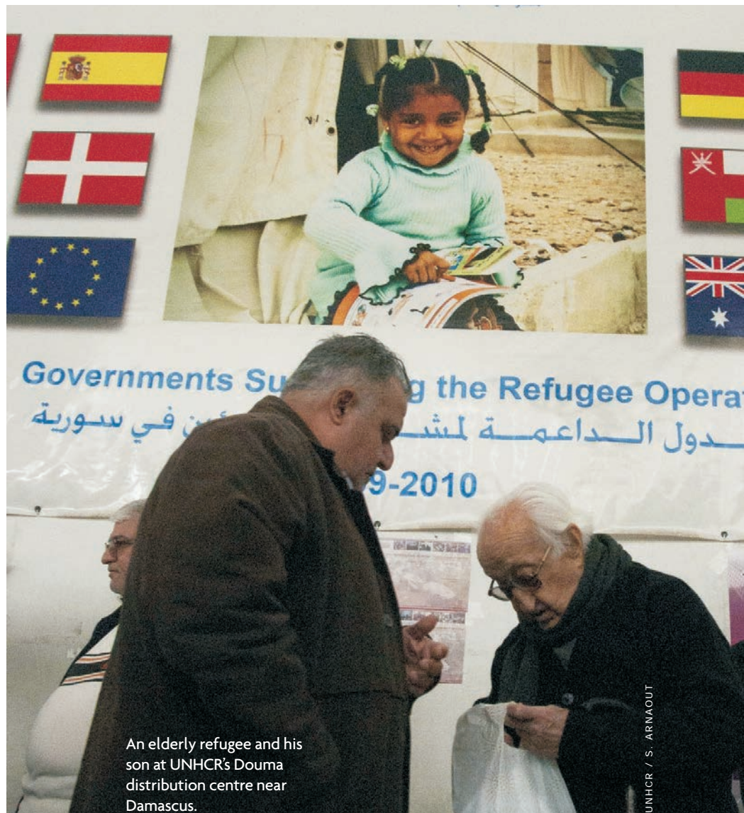
An elderly refugee and his son at UNHCR's Douma distribution centre near Damascus.