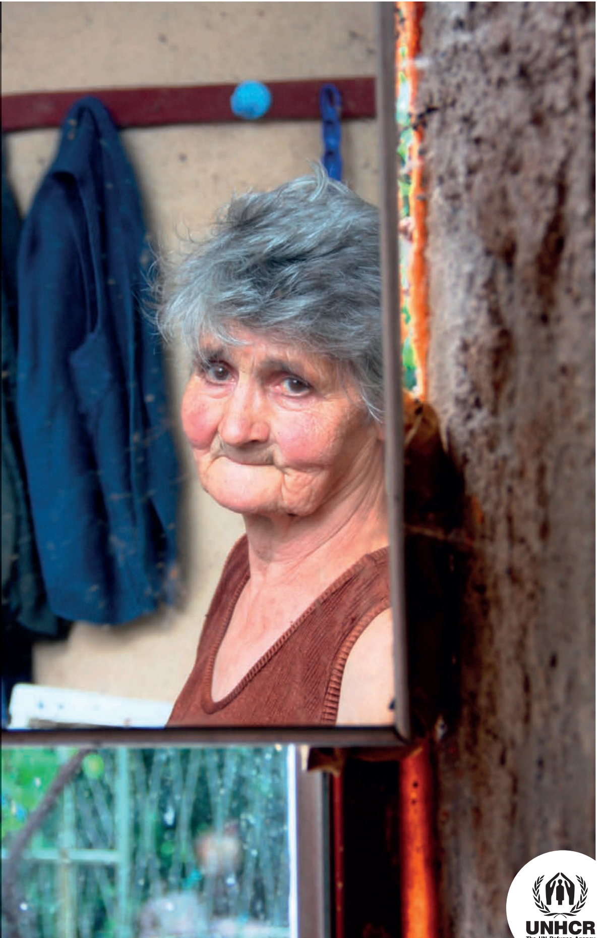
Returnee in Oton, Croatia.

The former Yugoslav Republic of Macedonia