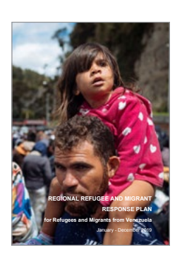
2019 Regional Refugee and Migrant Response Plan for Refugees and Migrants from Venezuela http://bit.ly/2Hv84Wr