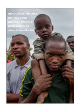
Democratic Republic of the Congo Country Refugee Response Plan 2019 – 2020 http://bit.ly/2QiqNr1