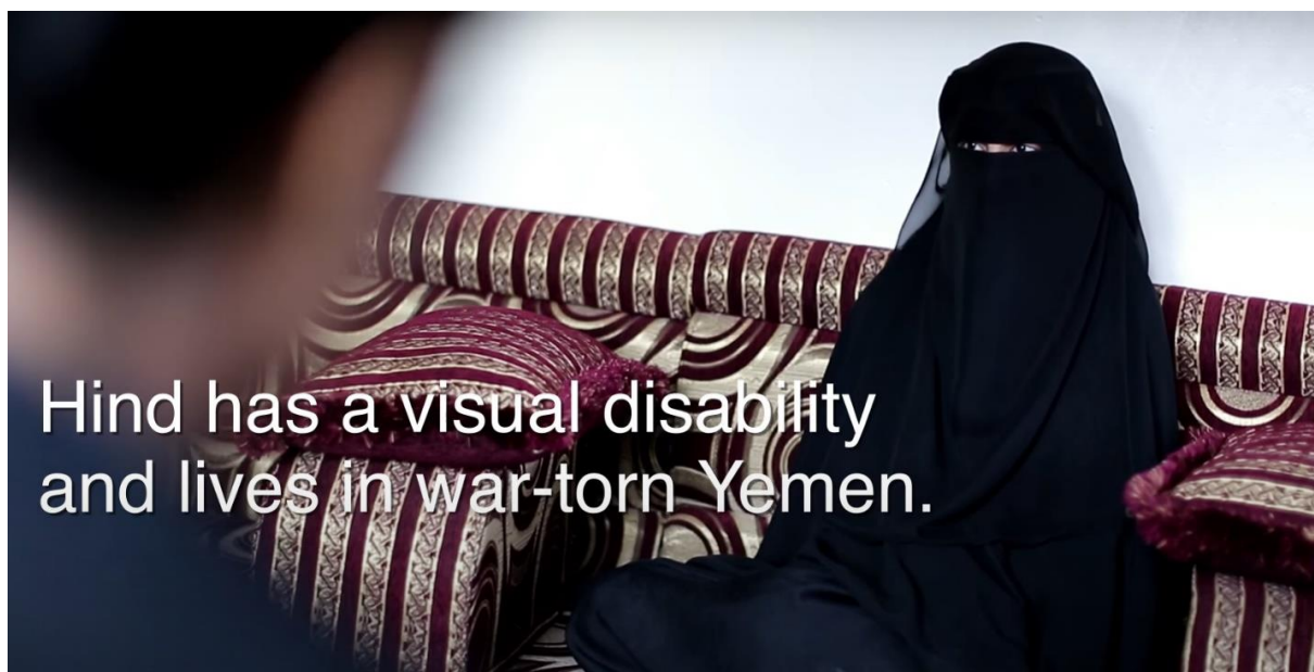
Caption: Hind has a visual disability and lives in war-torn Yemen