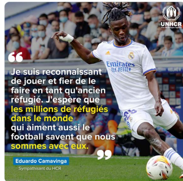
Eduardo Camavinga Sympathisant du HCR

Quand on leur donne l'opportunité de réussir, les personnes réfugiées peuvent inspirer en retour des millions de personnes. 🙌