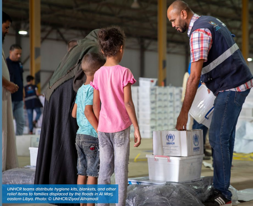
UNHCR teams distribute hygiene kits, blankets, and other relief items to families displaced by the floods in Al Marj, eastern Libya.

With your help, UNHCR has distributed emergency supplies including blankets, tarpaulins, kitchen sets and hygiene kits. Your gifts are also providing shelter, medicine, and power generators to affected communities.