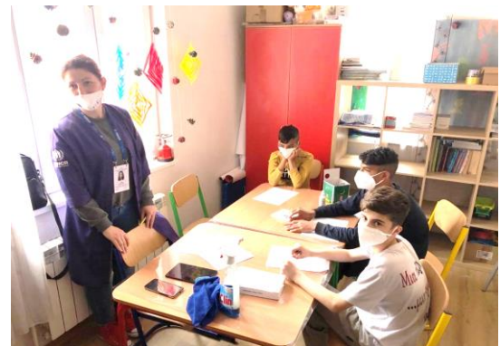
Non-formal educational workshop in Bosilegrad RTC, @Indigo, March

UNHCR corporate partner IKEA SEE issued a call for applications for re-skilling programme for refugees and asylum-seekers in Serbia , in order to enhance their employment prospects.