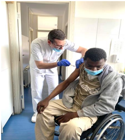
Vaccination against Covid in Krnjača Asylum Centre in Belgrade, 26 March 2021

On 26 March, Serbian authorities began a campaign of vaccination of refugees, asylum-seekers and migrants accommodated in 19 governmental centres across the country. Serbia became amongst the first countries in Europe to start vaccinating both refugees and asylum seekers in the centres and those accommodated privately. Five hundred and fifty refugees and migrants in government centres expressed interest in vaccination and 309 have been vaccinated by end-March. Additional 32 privately accommodated refugees have also been vaccinated against Covid. To promote vaccination, Batut Institute for Public Health, UNHCR, Serbian Commissariat for Refugees and Migration (SCRM) and WHO sensitized the refugees and migrants in terms of health promotion and protection from Covid.