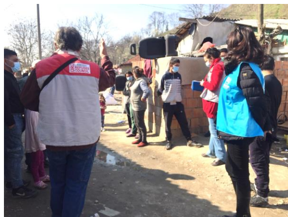
Joint health promotion activities of UNHCR and DRC in Tosin bunar informal Roma settlement, Belgrade, @UNHCR, 19 March 2021

The number of residents in Asylum (AC) or Reception/Transit Centres (RTC), again slightly decreased compared to end-February to 4,460 at the end of March 2021. They comprised 1,754 citizens of Afghanistan, 888 of Syria, 317 of Pakistan, 206 of Somalia, 188 of Bangladesh and 1,107 from 50 other countries. 3,797 are adult men, 256 adult women and 407 children, including 74 unaccompanied and separated children (UASC). A total of 5,463 new refugees and migrants were counted to be present in the country at end-March , including those staying outside of governmental centres. The authorities continued systematically gathering refugees and migrants staying outside the centres, in downtown Belgrade and in border areas, and transferring them to official centres with vacant places.