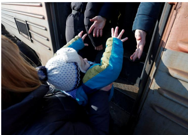
Ukraine. Evacuated residents board a train at a railway station before leaving Eastern Ukraine