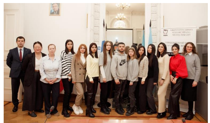
Recipients of the DAFI (Albert Einstein German Academic Refugee Initiative) scholarship during their annual meeting in the UN House in Moscow. 12.12.2022