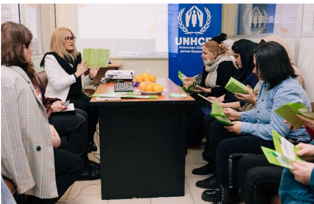
A training for refugee women from Afghanistan within the annual 16 Days of Activism against Gender-Based Violence campaign. Moscow, 02.12.22.