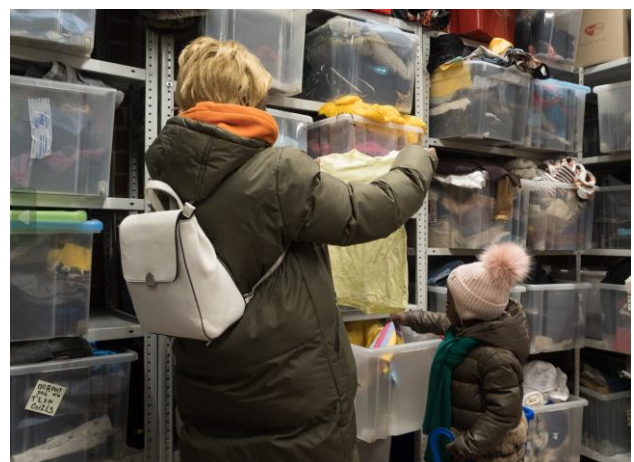
Refugees collecting humanitarian aid from the warehouse of Civic Assistance Committee NGO