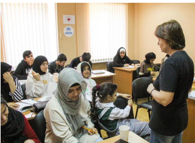
Russian language lesson for refugees from Syria, Yemen and Afghanistan, organized as part of a joint RRC-UNHCR project