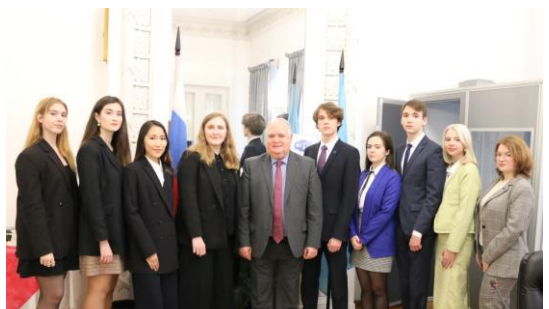
MUNRFE delegation attends UNHCR Russia briefing at the UN House in Moscow.