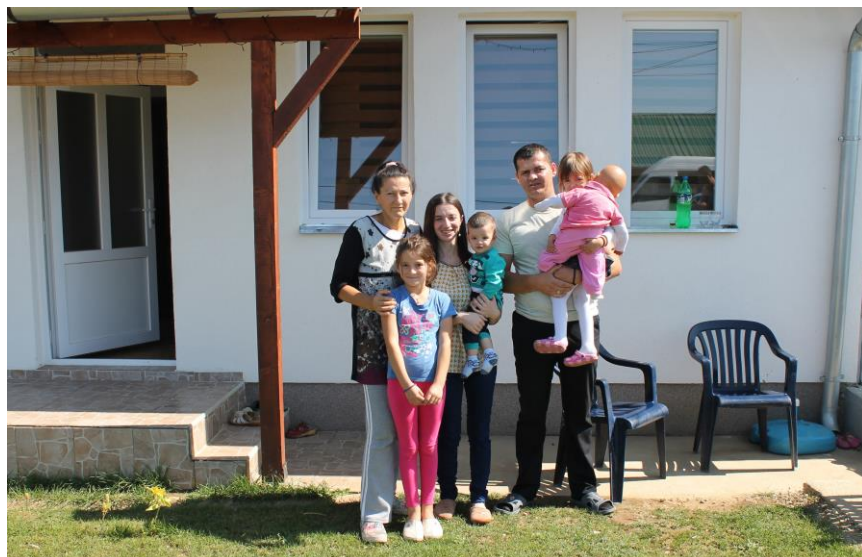
Voluntary returnee family near Pristina