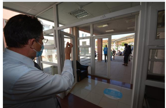
Asylum seekers being tested for COVID-19 at the Asylum Center in Magure/a. Read more here .